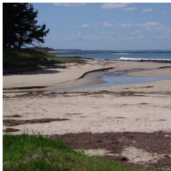
Figure 2: Shoreham beach, Western Port

Ten popular swimming beaches were monitored in Western Port (see Figure 1). Three sites were monitored on Phillip Island, a popular holiday spot during summer. Six sites were located along the strip of sandy beaches from Flinders to Somers. One site at was also located on the eastern shore at Coronet Bay.