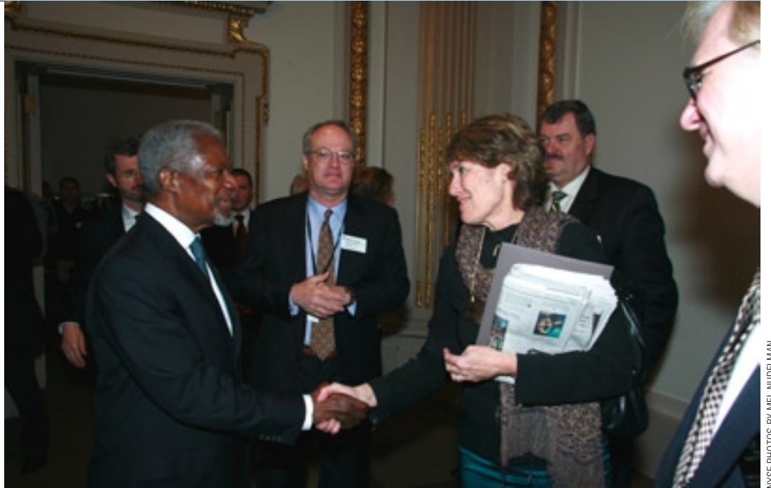
NYSE PHOTOS BY MEL NUDELMAN

More information on the Principles for Responsible Investment can be found at www.unpri.org