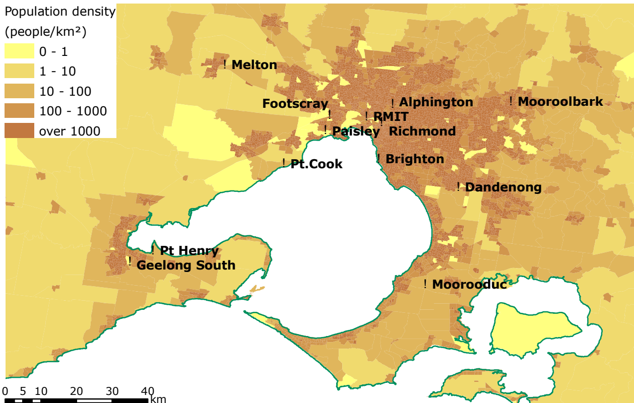
Figure 2: Monitoring stations in Port Phillip region